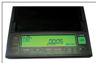
Welding Time Measurement