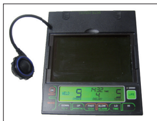
External button for grinding