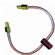
Double flame attachment