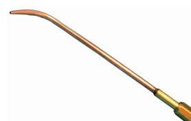
Flexible welding attachment