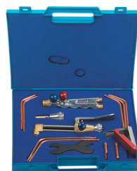
ORBIT COMBINED WELDING & CUTTING OUTFIT 81000