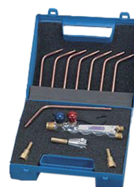
ORBIT L/W WELDING OUTFIT 81903