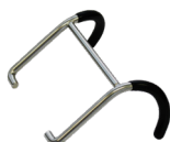
Bed hanger - plastic